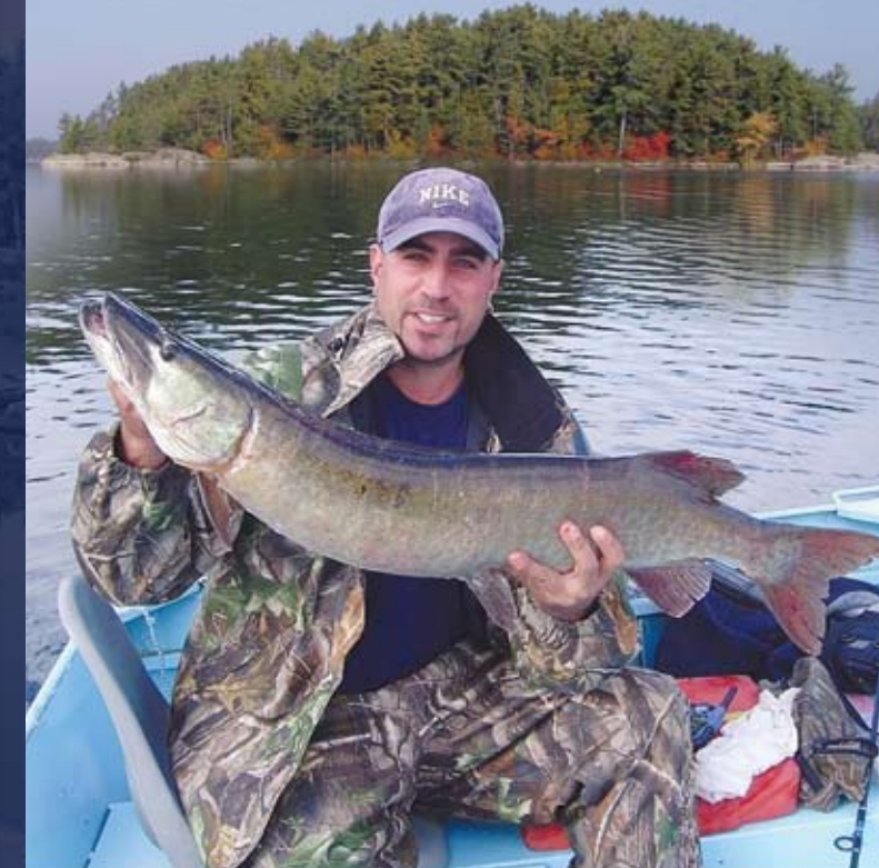
Commanda Island French River, Ontario, Canada